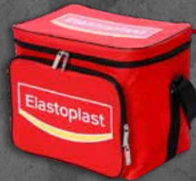
1 x COOLER BAG