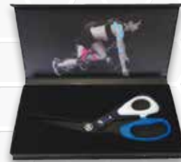
Strapit Ktape Scissors x1