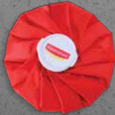
4 x ICE PACKS