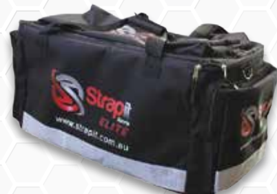
Strapit Large Wheelie Bag x1