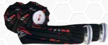
Strapit Ice Bags x2