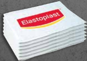
6 x HAND TOWELS