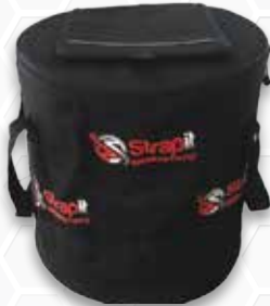
Strapit Cooler Bag x1