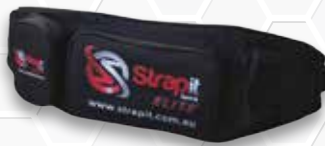
Strapit Trainers Bum Bag x2