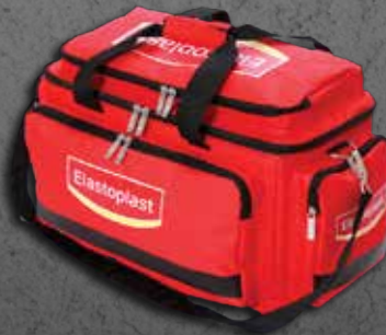
2 x MEDIUM TRAUMA BAG