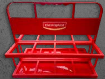
WATER BOTTLE HOLDER x 1