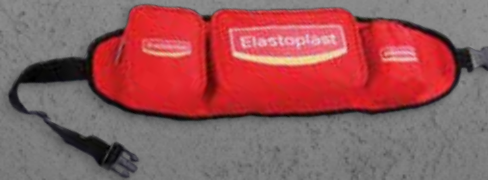
6 x BUM BAGS