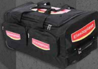
1 x WHEELIE BAG