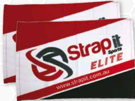
Strapit Towel x2