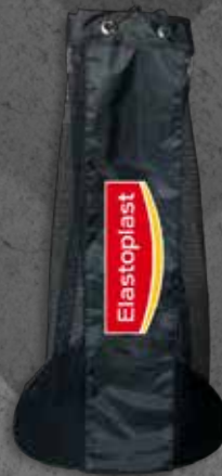
1 x BALL BAG