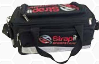
Strapit Trauma Bag x1